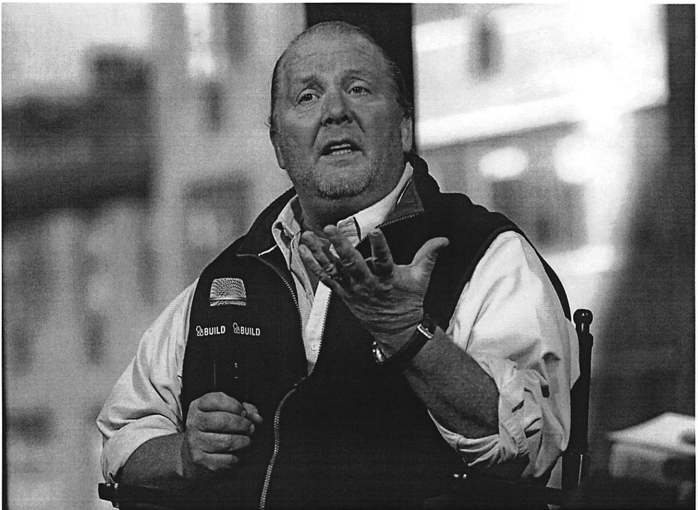
Mario Batali has been accused of sexual assault in a new lawsuit.